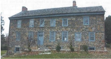
“John & Nathan Cope House”. Historic Resource #62, Pennsylvania Historical Resource Survey Form