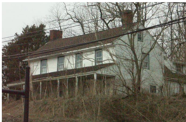
"Strode's Mill Miller's House". Historic Resource #134, Pennsylvania Historical Resource Survey Form