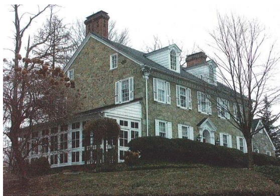
East Bradford Boarding School for Boys". Historic Resource #141, Pennsylvania Historical Resource Survey Form